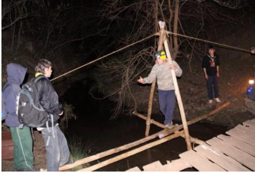
Kengray's Cobras Patrol at the river crossing

Scouts had to complete tasks such as a river crossing and intercepting and decoding a Morse code message. Kengray achieved a convincing first and second place.