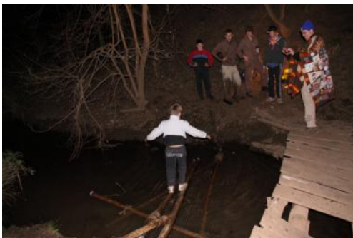
1st Bedfordview at the river crossing

Scouts had to complete tasks such as a river crossing and intercepting and decoding a Morse code message. Kengray achieved a convincing first and second place.